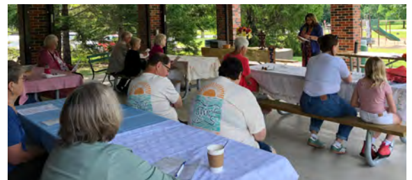
Worship and Social Lost Woods Park - July