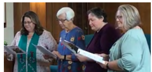
"Friends" Special Music - August